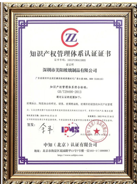
Corporate intellectual property