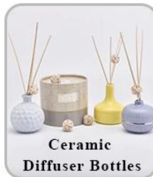
Ceramic Diffuser Bottles