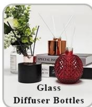
Glass Diffuser Bottles