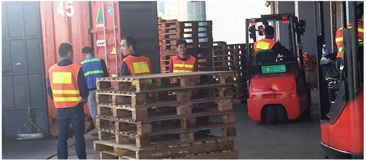
Own professional shipping company( Shenzhen Sunny Worldwide logistics)