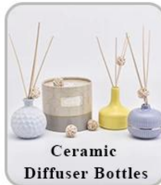
Ceramic Diffuser Bottles