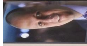
5 minutes with...

More than just buying The immensely valuable Meet The Suppliers event will return this year.