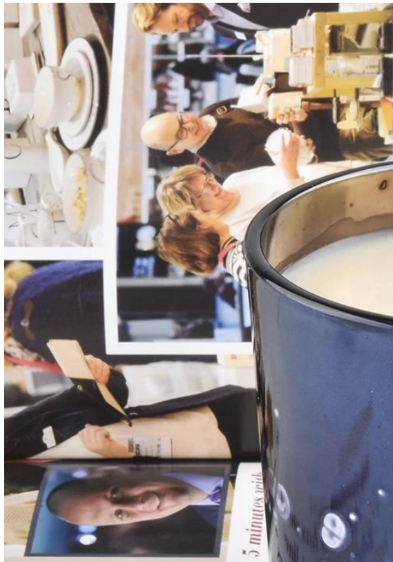
5 minutes with

More than just buying The immensely valuable Meet The Expert sessions will return, this year featuring masterclasses