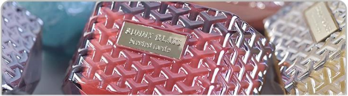
Glass Candle Holders