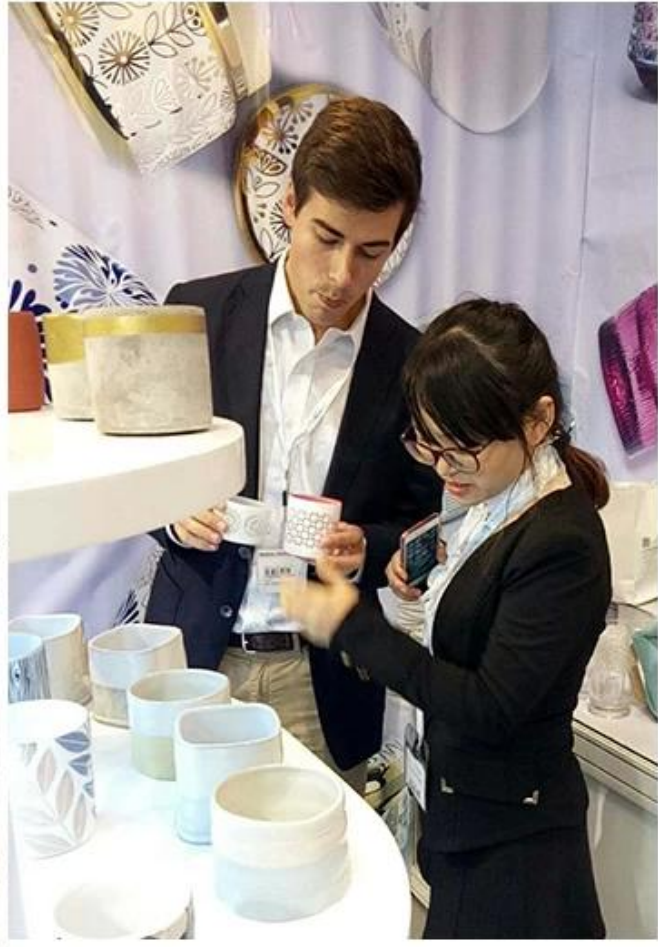
We have taken part in various exhibitions since 2002 year, like Shanghai, London, Las Vegas,Hongkong show.