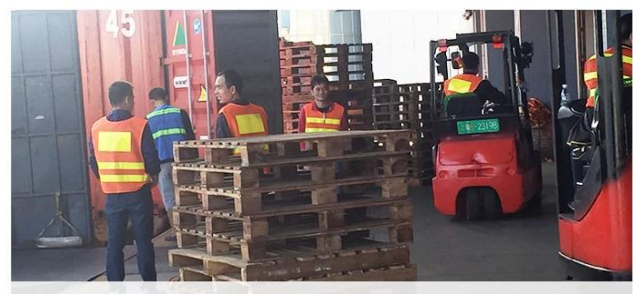
Own professional shipping company( Shenzhen Sunny Worldwide logistics)