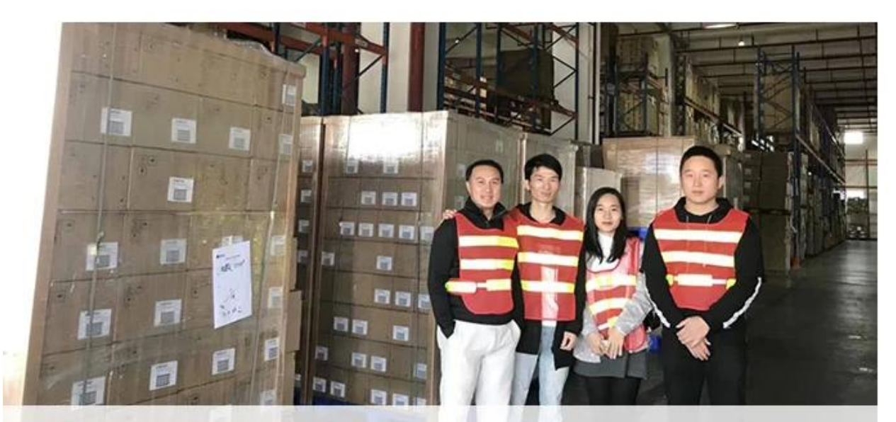
20+ years freight history and WCA members.