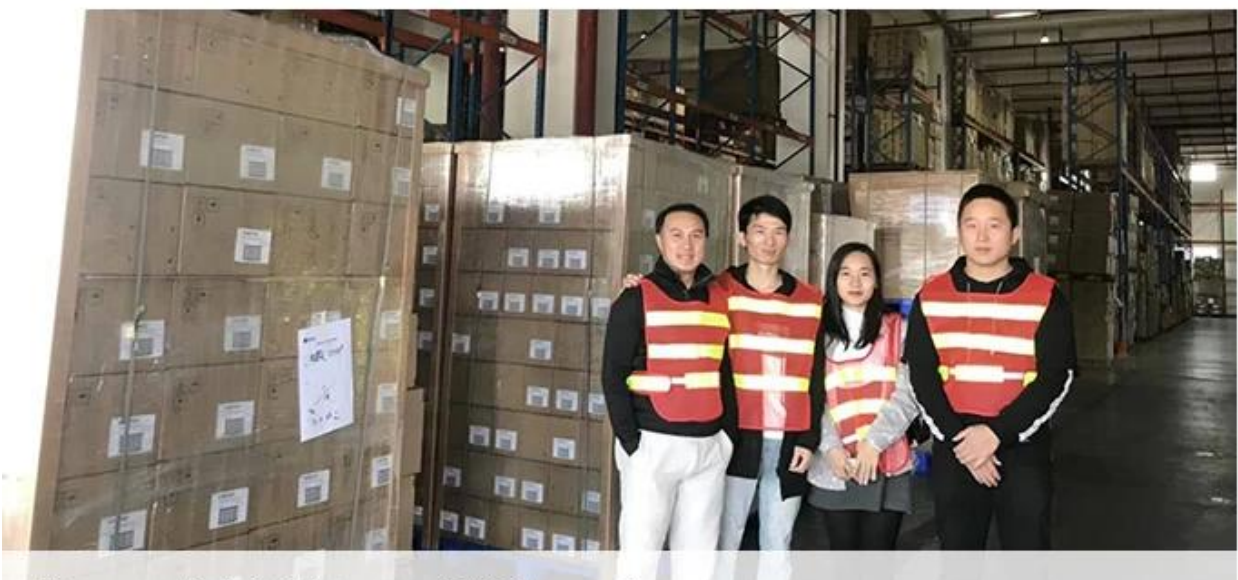
20+ years freight history and WCA members.

Own professional shipping company( Shenzhen Sunny Worldwide logistics)