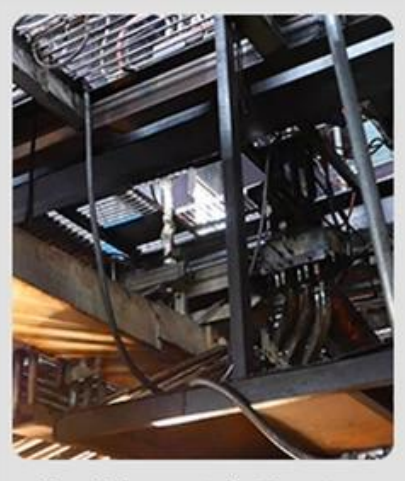
1. Material Cutting