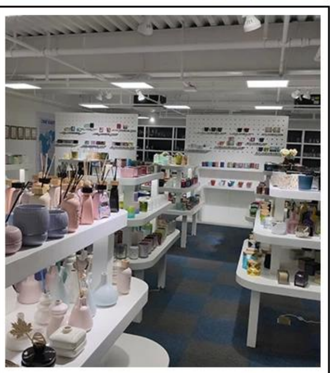
There are more than 5000 products in sample room of Sunny Glassware for your reference.