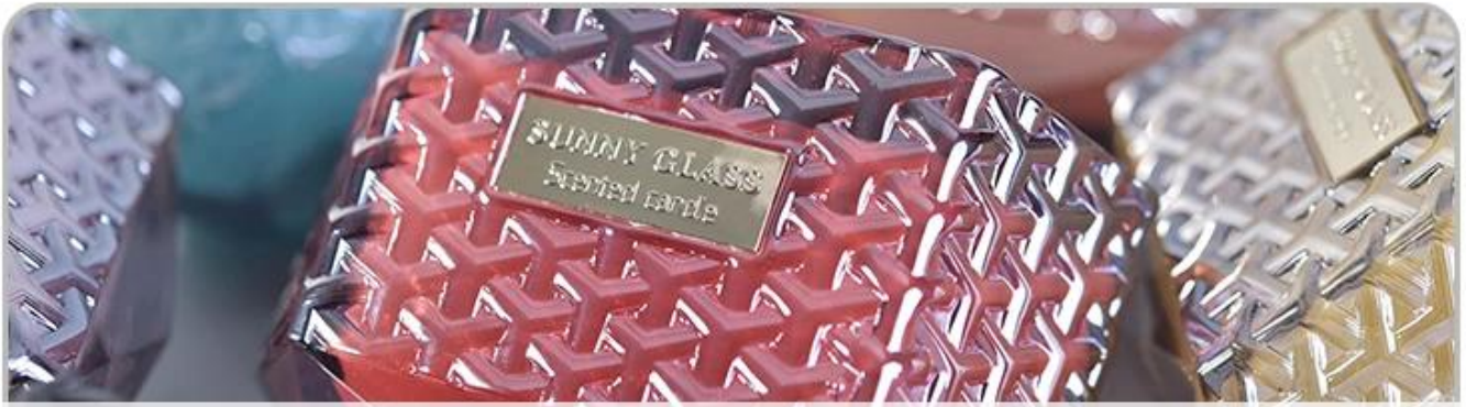
Glass Candle Holders