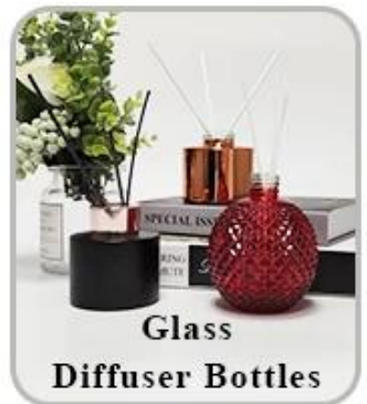
Glass Diffuser Bottles