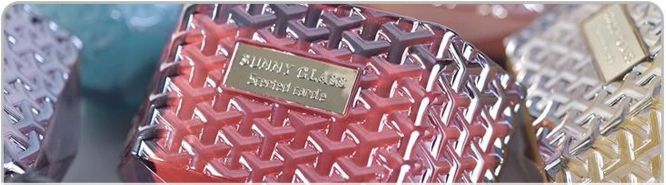
Glass Candle Holders