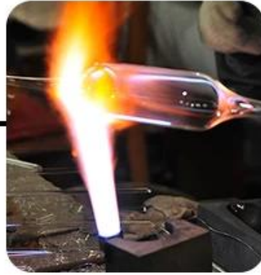
2、 Mouth Blown Moulding