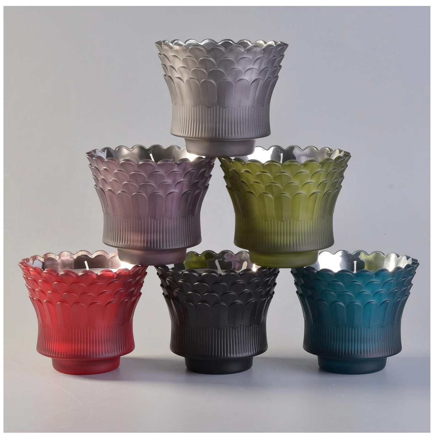
Packing & Delivery

To better ensure the safety of your goods, professional, environmentally friendly, convenient and efficient packaging services will be provided.