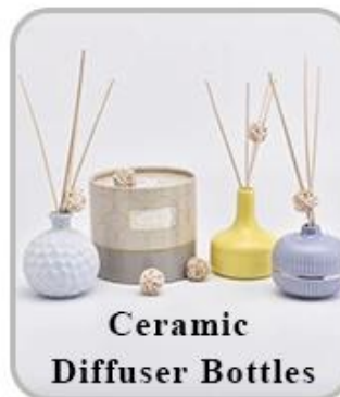
Ceramic Diffuser Bottles