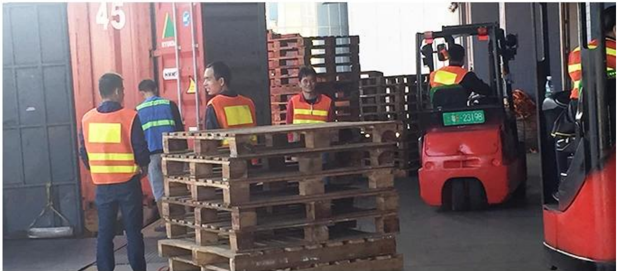
Own professional shipping company( Shenzhen Sunny Worldwide logistics)