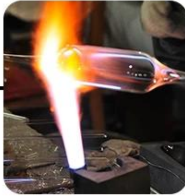
2、 Mouth Blown Moulding