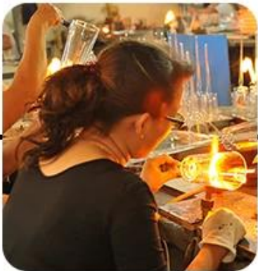
6、 Put on handle