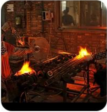
1、 Material Heating