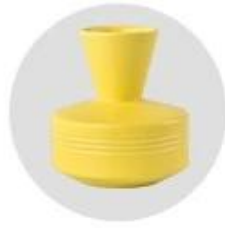
Solid color glaze