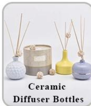
Ceramic Diffuser Bottles