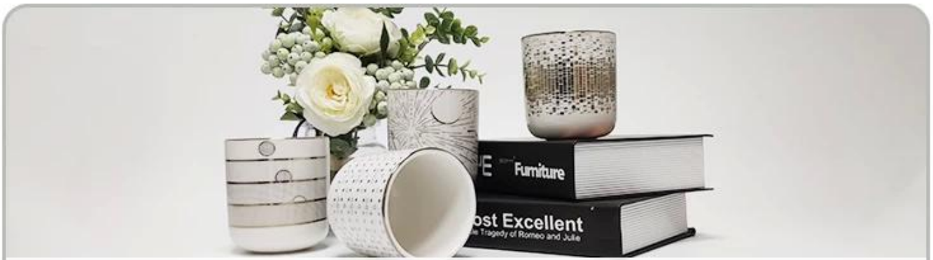
Ceramic Candle Holders