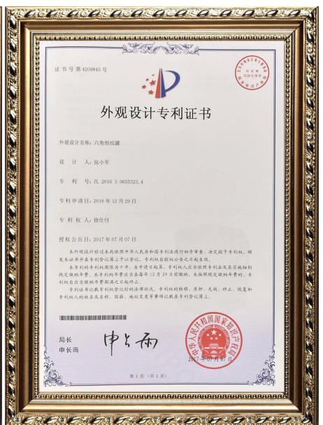
Patent no.: 20163065323.4