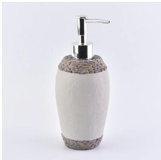
Lotion dispenser SGSJL18111602-4 Top dia:85mm Bottom dia:50mm Height:135mm Weight:295g Capacity: 170ml

(All the images on this site are copyrighted by Sunny Glassware. Any unauthorized reprinting will be regarded as copyright infringement.)