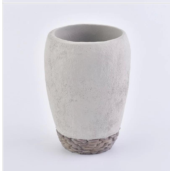
Tumbler SGSJL18111602-2 Top dia:75mm Bottom dia:45mm Height:110mm Weight:333g Capacity: 230ml