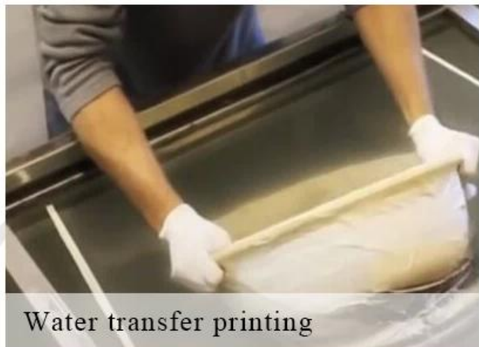
Water transfer printing