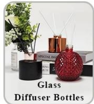
Glass Diffuser Bottles