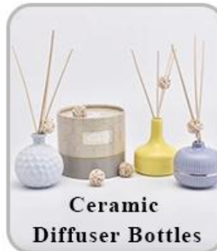
Ceramic Diffuser Bottles