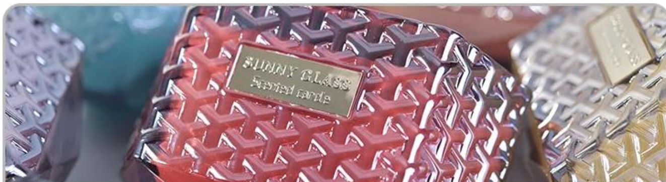
Glass Candle Holders