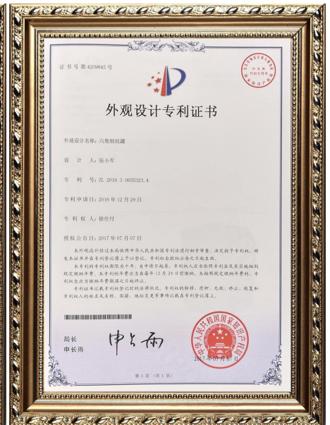
Patent no.: 20163065323.4