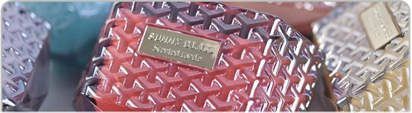
Glass Candle Holders