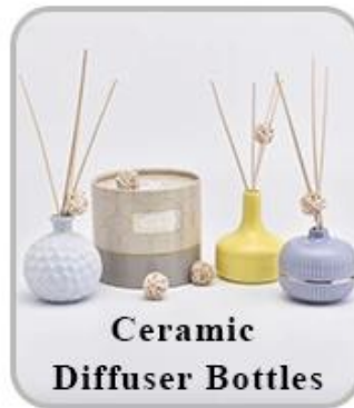
Ceramic Diffuser Bottles