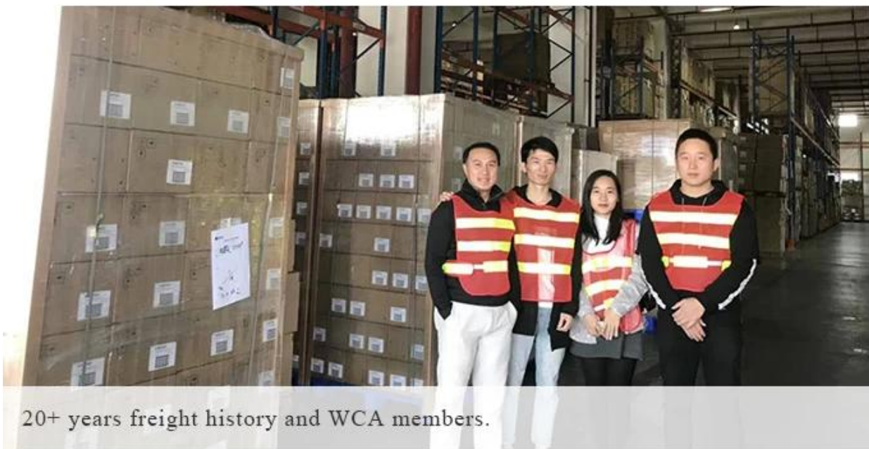
20+ years freight history and WCA members.