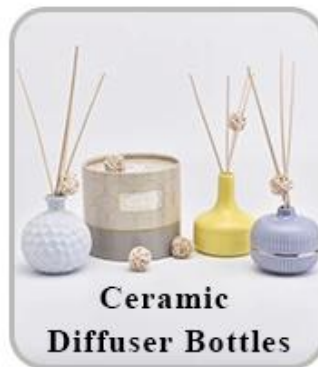
Ceramic Diffuser Bottles