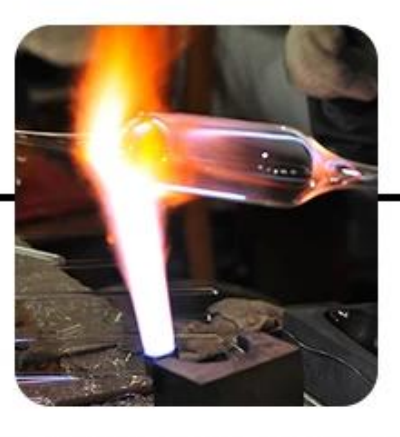
2. Mouth Blown Moulding