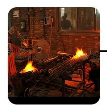
1. Material Heating