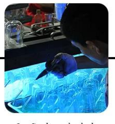
8. Sealing the hole