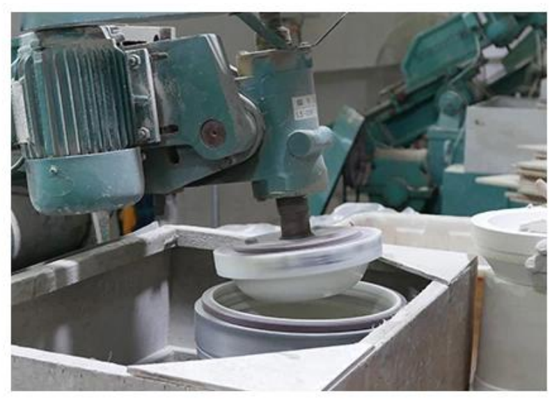
There are about 20000 square meters in our factory which was built in 1992 year; Superior quality and high efficiency can be guranteed.