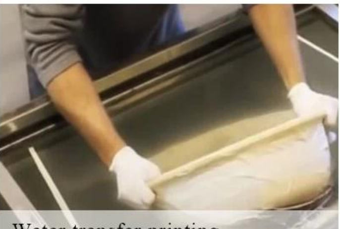
Water transfer printing