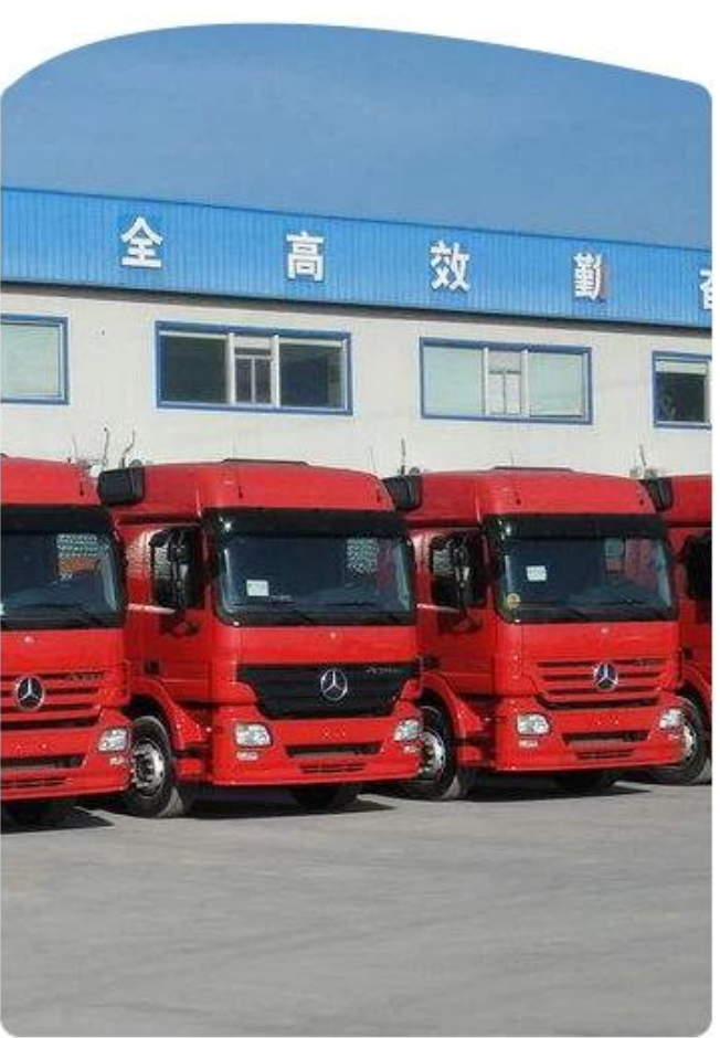
20+ years freight history and WCA members