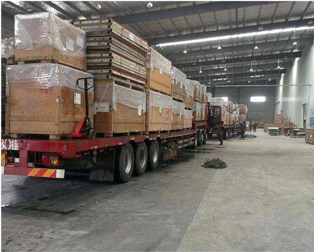
Own professional shipping company(Shenzhen Sunny Worldwide logistics)