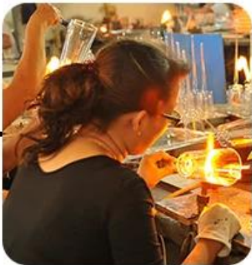
6、Put on handle