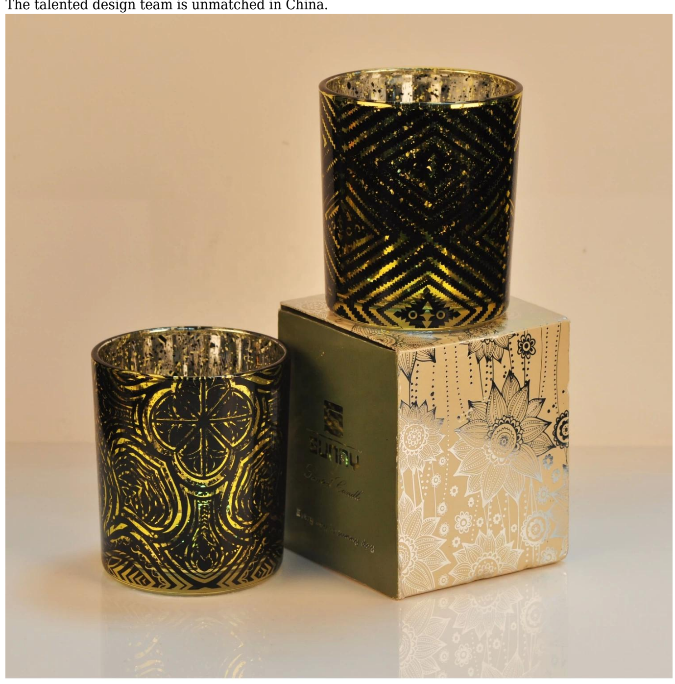
Product Description Award-winning team of designers has won the trust of many upscale brands like NEST Fragrance . The talented design team is unmatched in China.