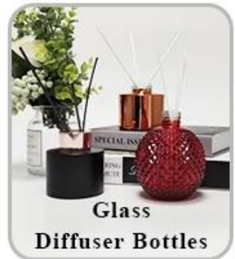
Glass Diffuser Bottles