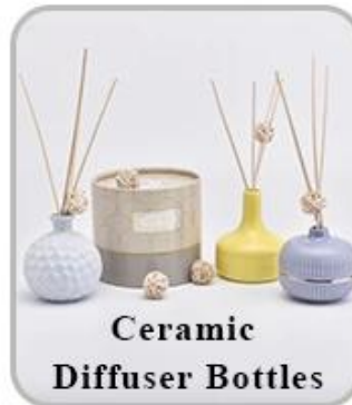
Ceramic Diffuser Bottles