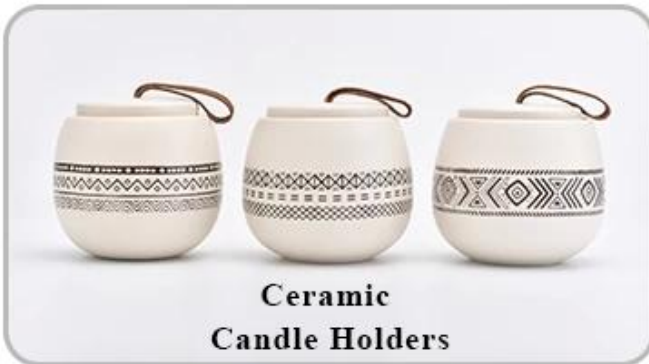
Ceramic Candle Holders