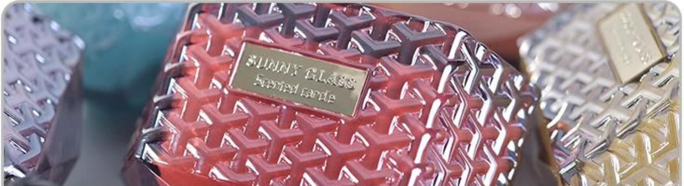
Glass Candle Holders