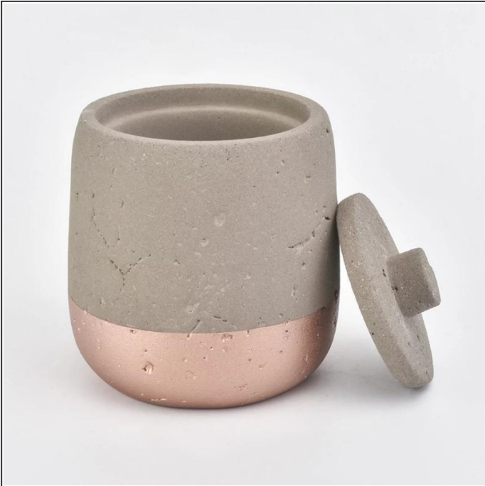
Cotton Jar SGSJL18102507-4 Top dia: 86mm Bottom dia: 75mm Max dia: 98mm Height: 96mm Weight: 867 Capacity: 276ml