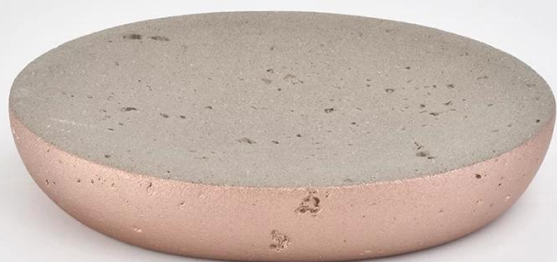
Soap dish SGSJL18102507-1 Length: 133mm Width: 103mm Height: 24mm Weight: 437g