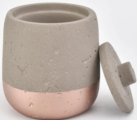
Cotton Jar SGSJL18102507-4 Top dia: 86mm Bottom dia: 75mm Max dia: 98mm Height: 96mm Weight: 867 Capacity: 276ml