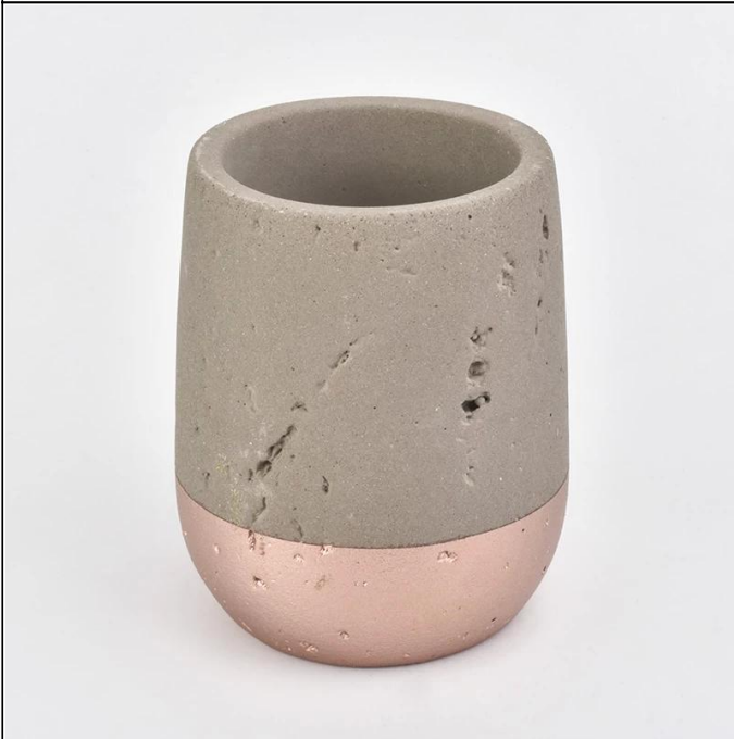
Tumbler SGSJL18102507-2 Top dia: 71mm Bottom dia: 63mm Max dia: 81mm Height: 96mm Weight: 482g Capacity: 207mm