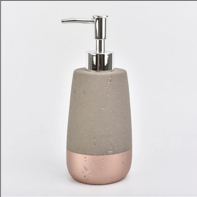
Lotion dispenser SGSJL18102507-5 Top dia: 26mm Bottom dia: 62mm Max dia: 77mm Height: 130mm Height with lid: 200mm Weight: 806g Capacity: 163ml