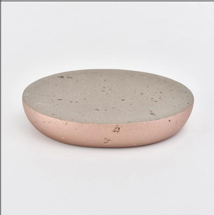
Soap dish SGSJL18102507-1 Length: 133mm Width: 103mm Height: 24mm Weight: 437g