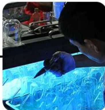
8、Sealing the hole