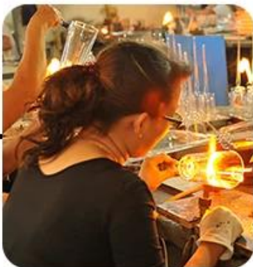
6、Put on handle