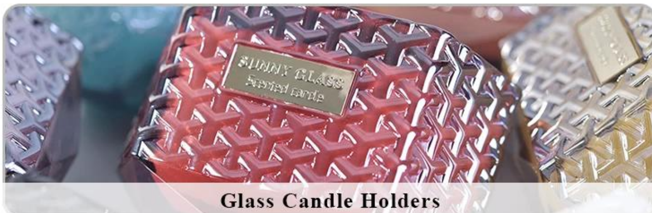
Glass Candle Holders