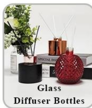
Glass Diffuser Bottles