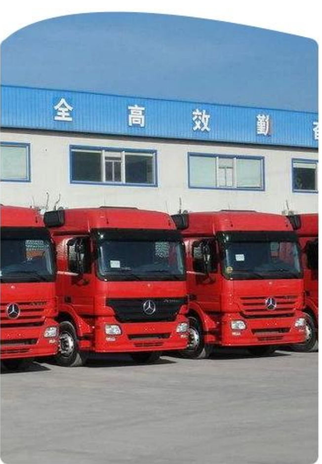
20+ years freight history and WCA members