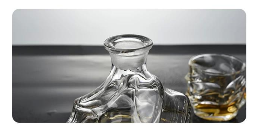
High-grade glass maintains temperature to enhance the pleasure of every sip.

Rolled rim opening ensures a smooth pour