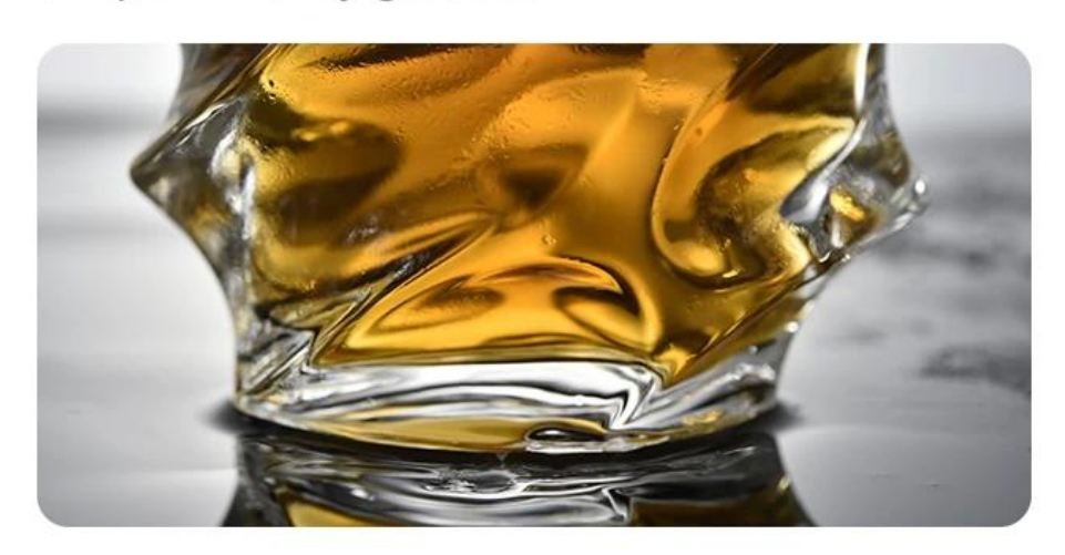
Hand blown and cut lead-free glass

Rolled rim opening ensures a smooth pour