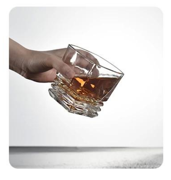
The selection of raw Lead-free crystal material presents the true color of wine