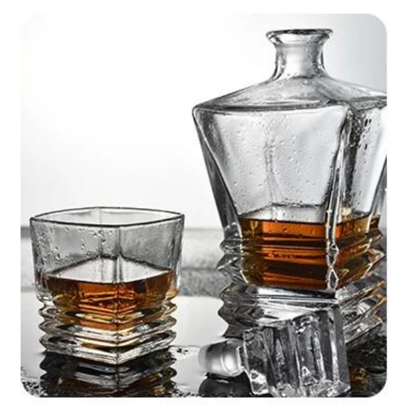
You can choose a variety of different exquisite shapes which present beauty