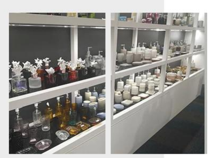
There are more than 5000 products in sample room of Sunny Glassware for your reference. No second Co. in China!