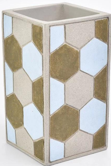
Tumbler SGSJL18102502-2 Top dia: 65*65mm Bottom dia: 65mm Height: 115mm Weight: 396g Capacity: 277ml