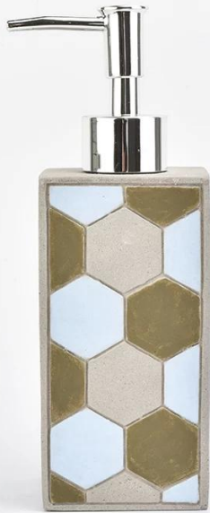
Lotion dispenser SGSJL18102502-4 Top dia: 27mm Bottom dia: 65mm Height: 129mm Height with lid: 192mm Weight: 574g Capacity: 246ml