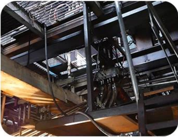
1、 Material Cutting