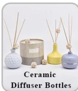
Ceramic Diffuser Bottles