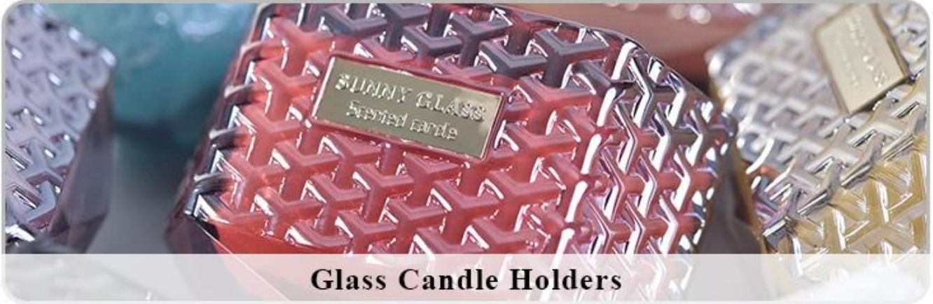
Glass Candle Holders