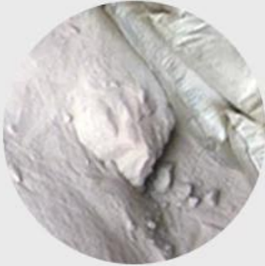
1、 Raw Material